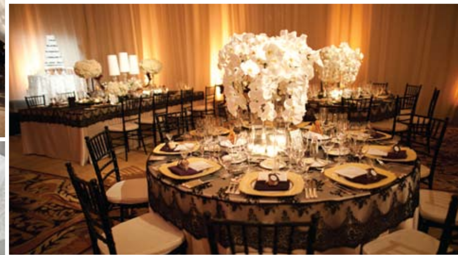
Delicate black lace caps added extra glamour to the lush white floral centerpieces, sparkling crystal accents and glowing votives on each reception table.